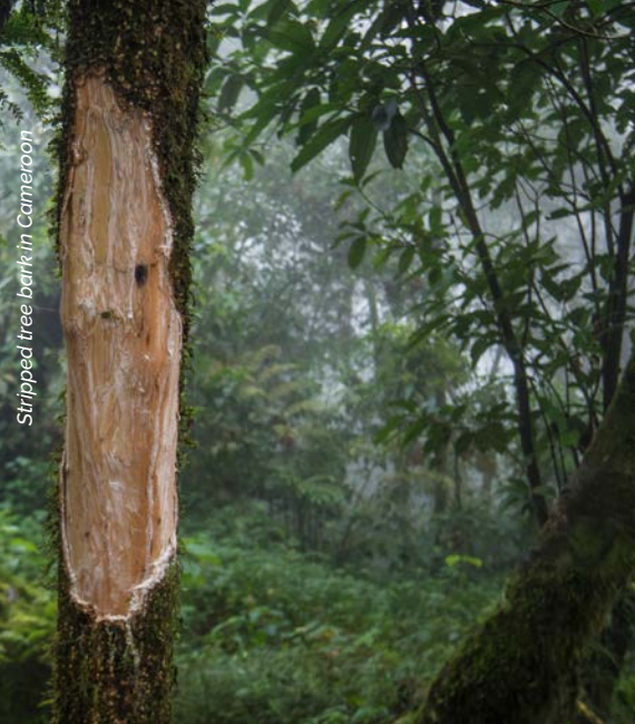
Stripped tree bark in Cameroon