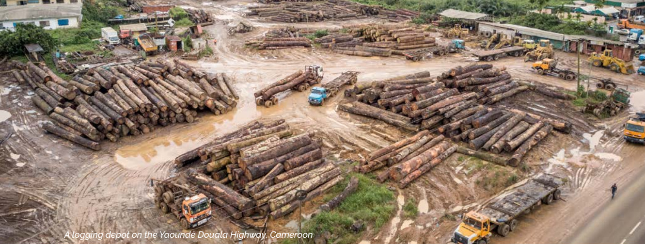
A logging depot on the Yaoundé Douala Highway, Cameroon