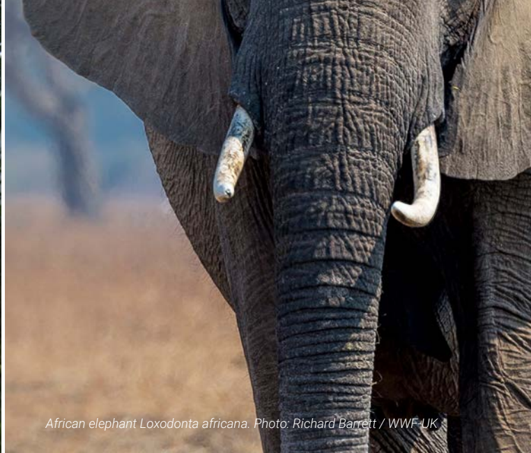
African elephant Loxodonta africana .

“ The AFRICA-TWIX platform as a tool for cooperation between law enforcement agencies in the fight against wildlife crime is an unbelievable investigation accelerator in dismantling transnational IWT networks. Further, the tool has expanded my address book in an extraordinary way. To me AFRICA-TWIX is immeasurably rich